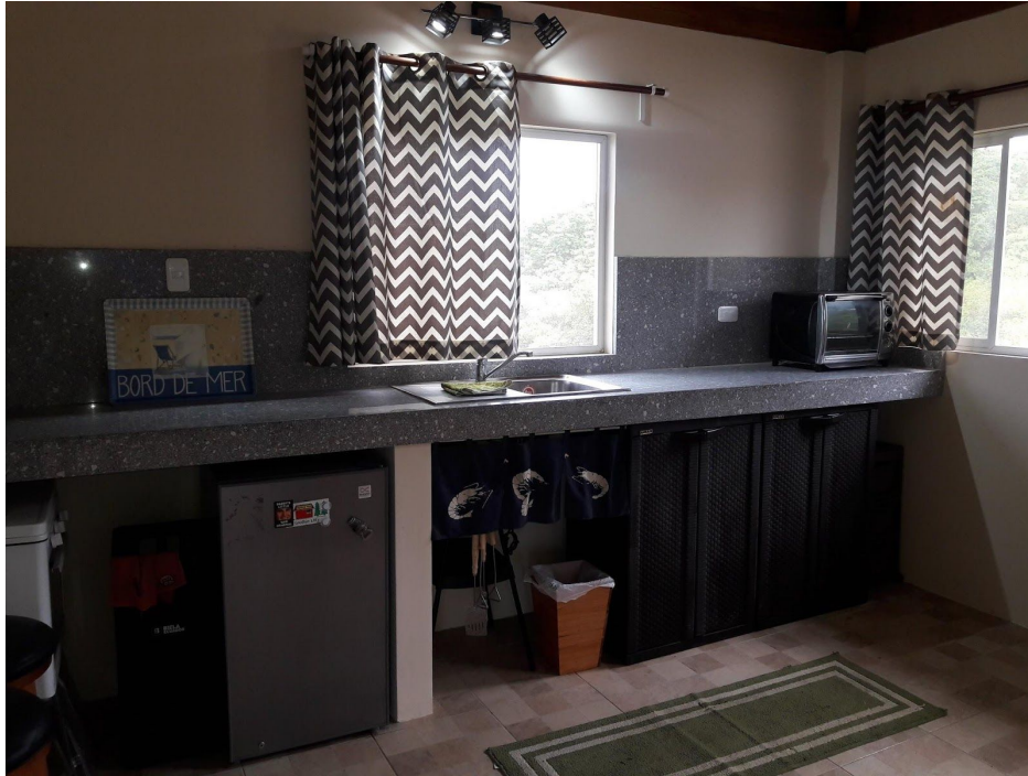
Kitchen with sink, small refrigerator and two burner stove/oven