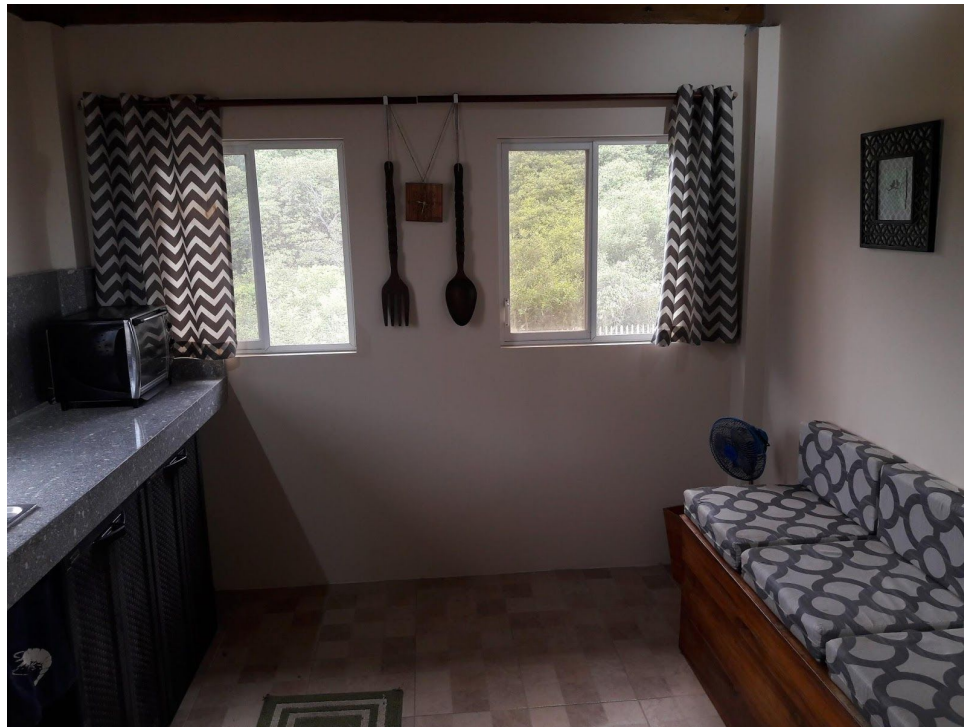
There is a tall table (previous photo) that can be used with the bench for dining