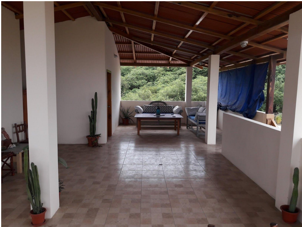
The rooftop terrace is a great place for entertaining