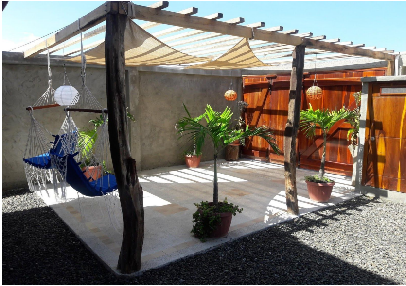
Carport or Outdoor Living Space featuring hammock chairs, Solar Globes, and Sun Sail Shades