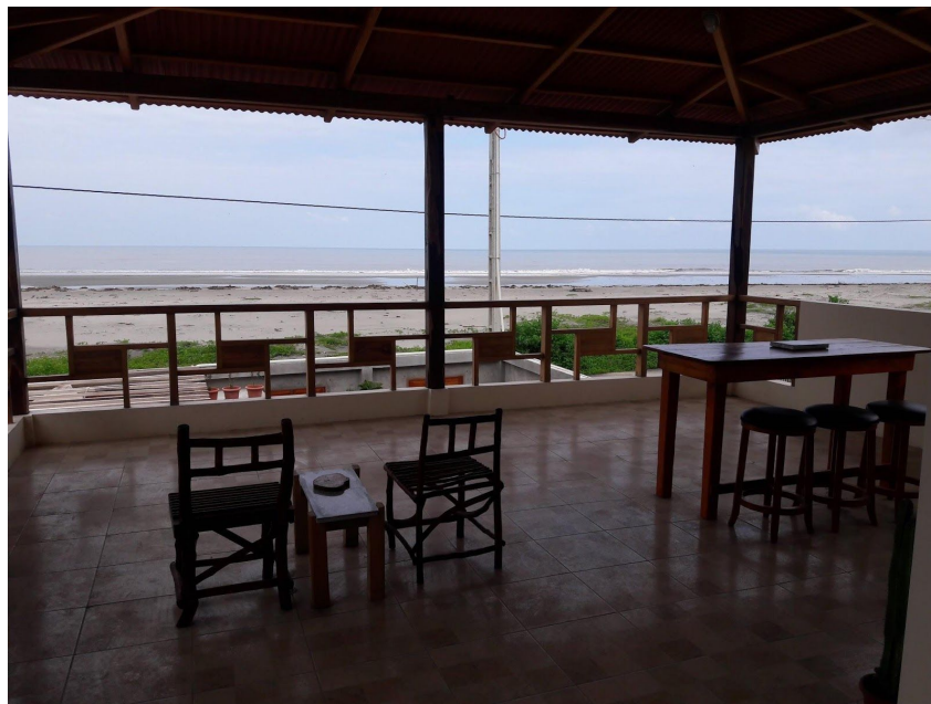
The full rooftop terrace provides panoramic views of the Pacific ocean