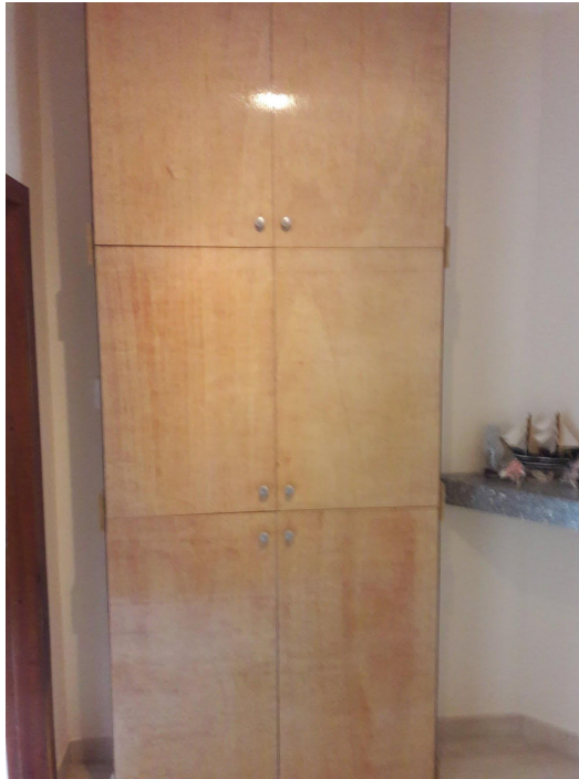
Custom Wood Pantry