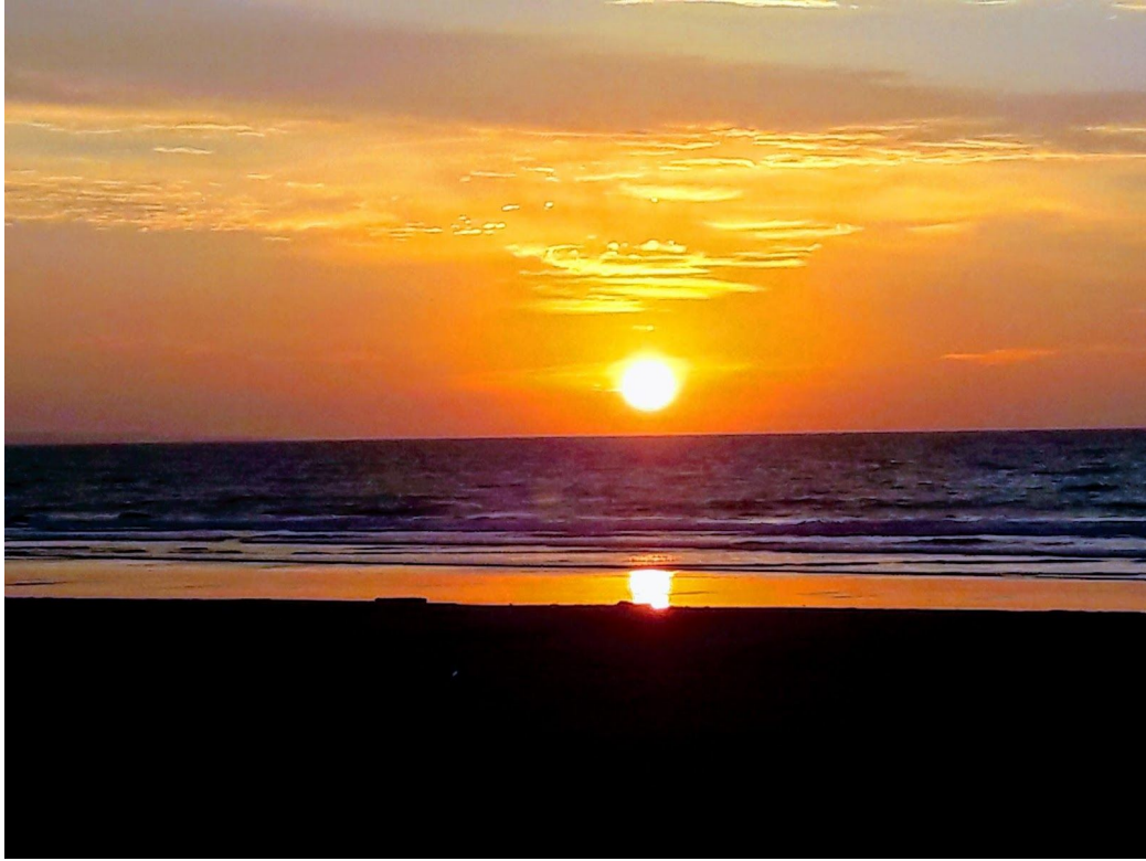
Enjoy wonderful sunsets on the Pacific Ocean