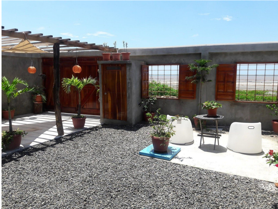
A privacy wall surrounds the property with custom shutters facing the Pacific Ocean