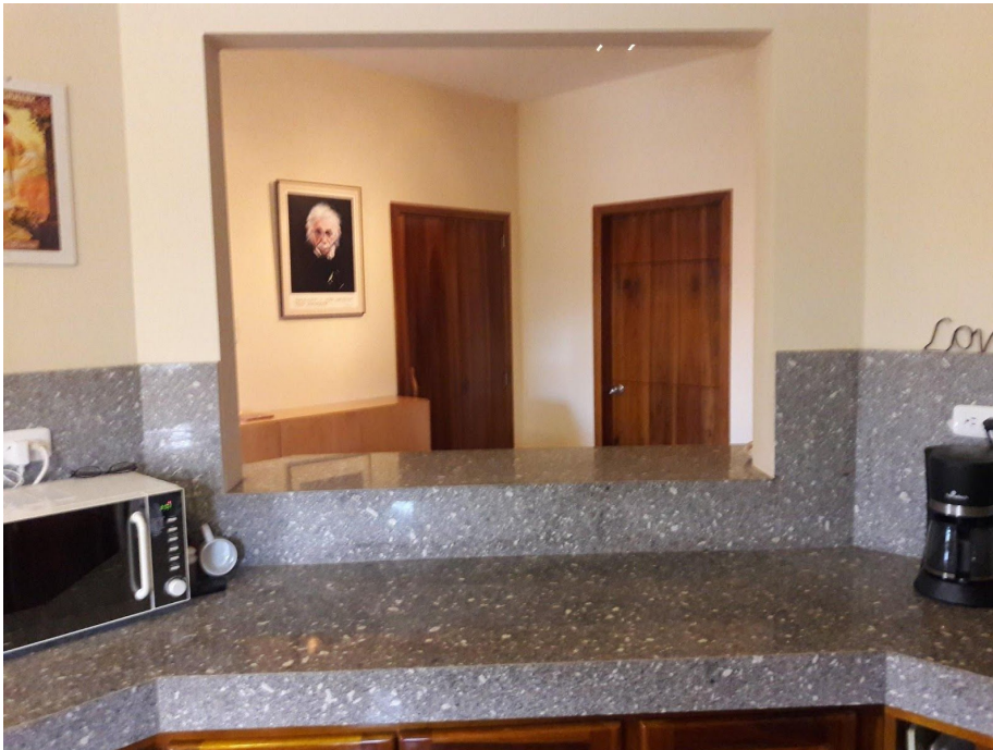
Pass Through/Breakfast Bar