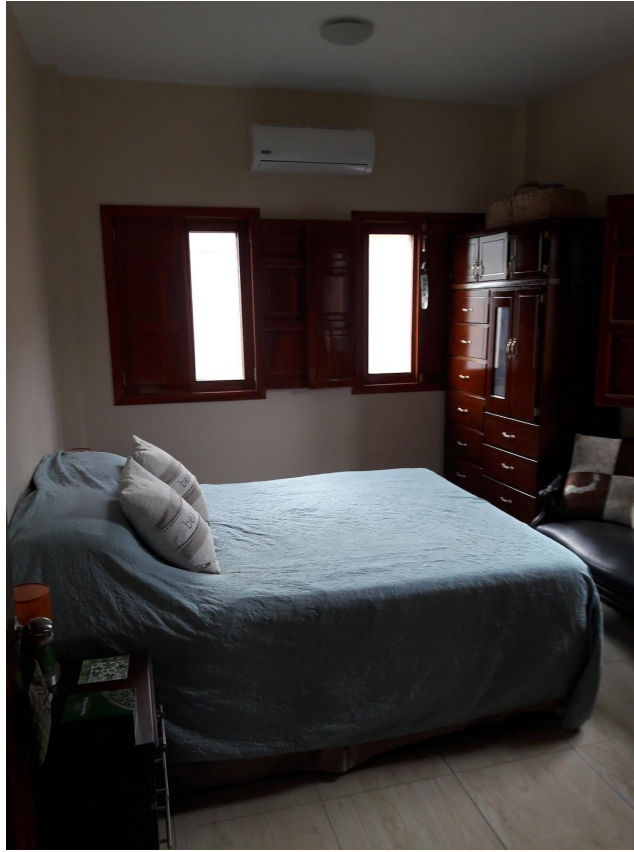
Master Bedroom en Suite