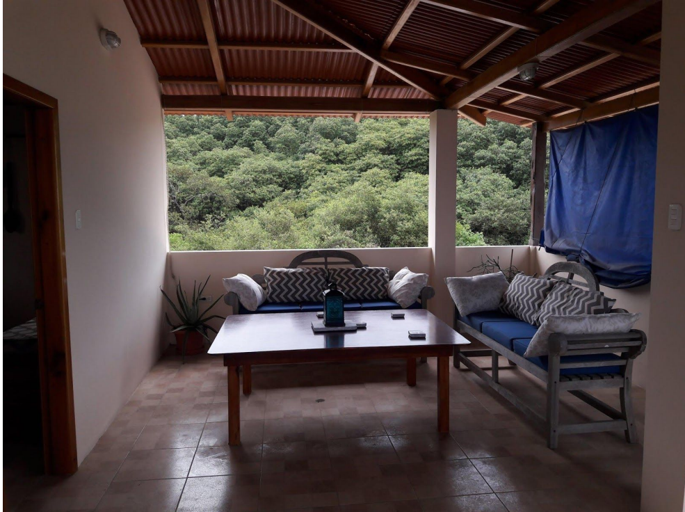
The view of the protected Mangroves to the East