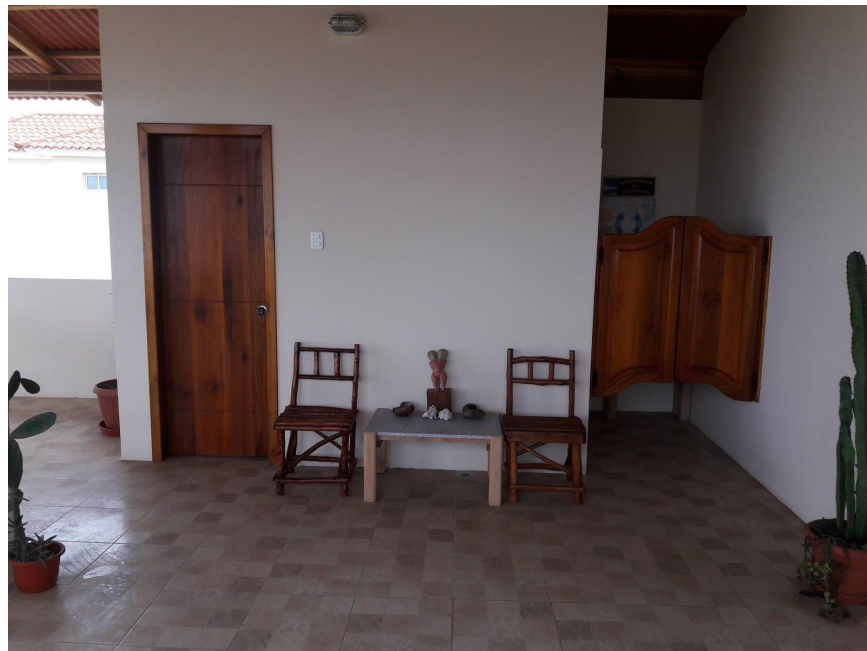
Seating outside the bathroom and urinal room